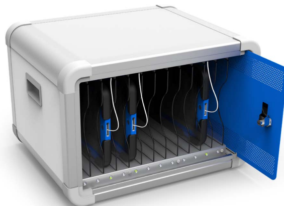
DeskCabby Front Open

* Compatible with devices charged by USB only.