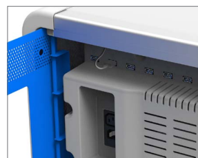
Mains power lead plugged in at the back