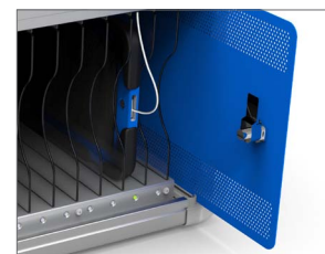
Retractable metal door