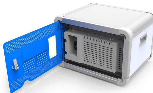
DeskCabby Back Open