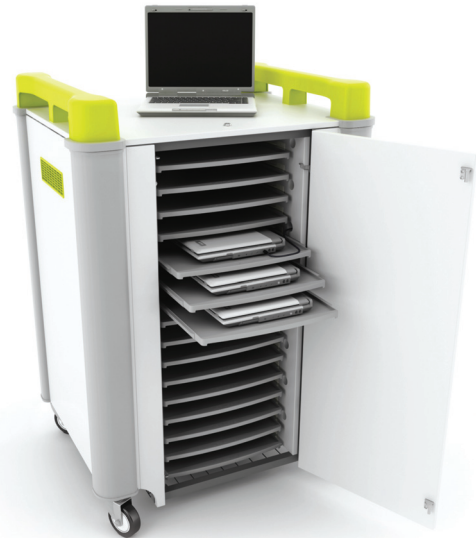
LapCabby 16H 16 Bay Horizontal Laptop Charging Unit

Individual laptop storage boxes to keep your laptops protected from knocks and scrapes. Each laptop storage box stores and charges two mini laptops.