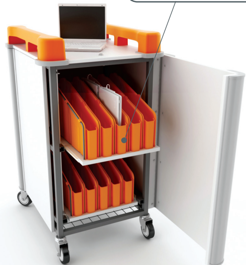
LapCabbyMini 20V 20 Bay Vertical Laptop Charging Unit

Individual laptop storage boxes to keep your laptops protected from knocks and scrapes. Each laptop storage box stores and charges two mini laptops.