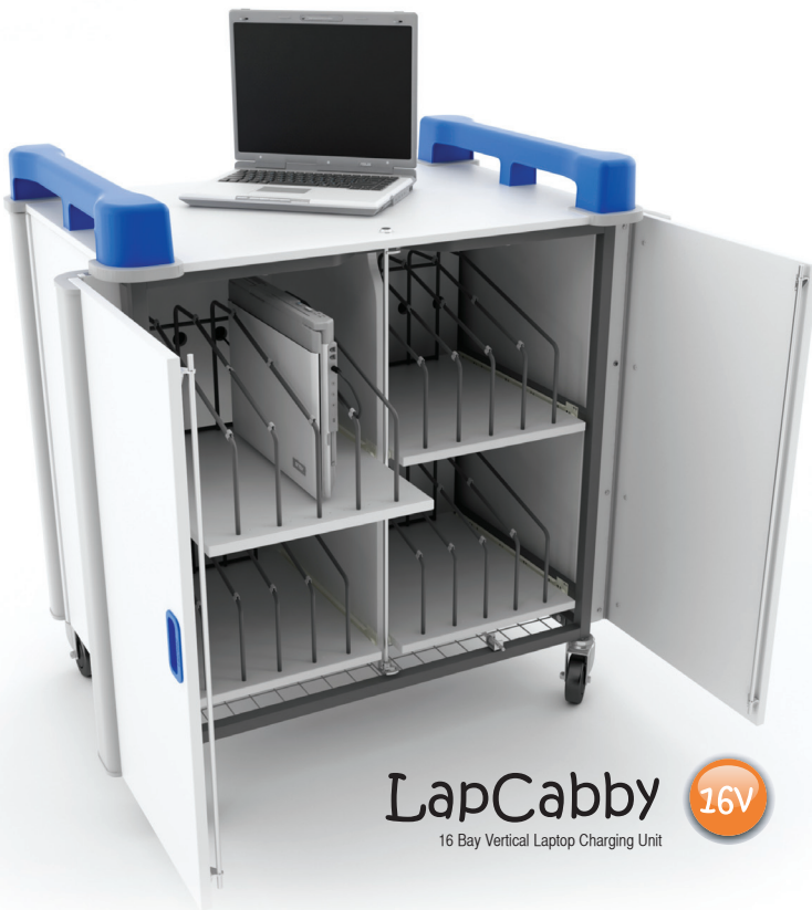
LapCabby 16V 16 Bay Vertical Laptop Charging Unit